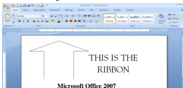
Microsoft Office 2007 With "The Ribbon"

conjunction with the redesign and release of the newest Windows Operating System, Windows Vista. Many will be surprised to find that Word 2007 has been entirely overhauled and has emerged with a completely new look and feel. Some critics have even gone as far as to compare the look to something that would be found when using the Macintosh Operating System. Gone are the days of toolbars, drop down menus and task panes. Instead, you will find that all of the navigation has been replaced by the "ribbon" which is essentially tabs that change to display tools that were previously hidden throughout menus. Based on research and user surveys, Microsoft designed the ribbon with the idea that it will take a user less clicks to get to an item.